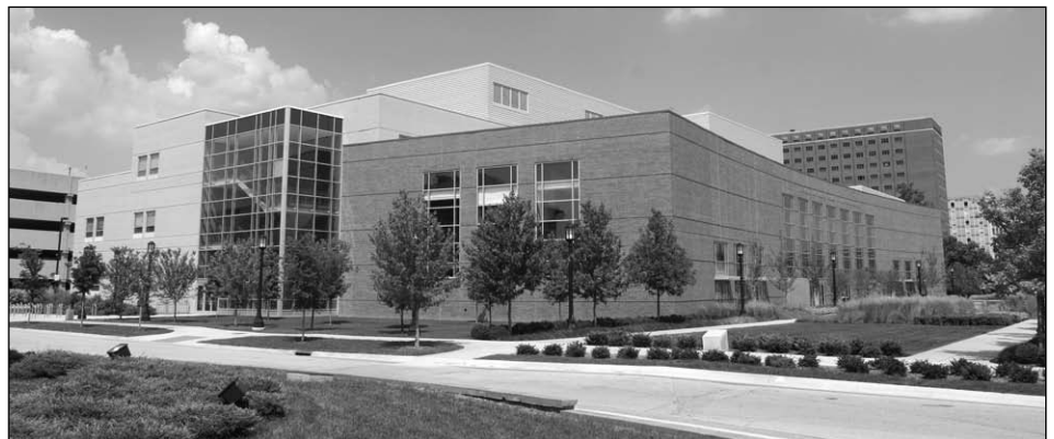
The Campus and Community Activities Committee has scheduled a tour of Yue-Kong Pao Hall of Visual and Performing Arts for Sept. 2.